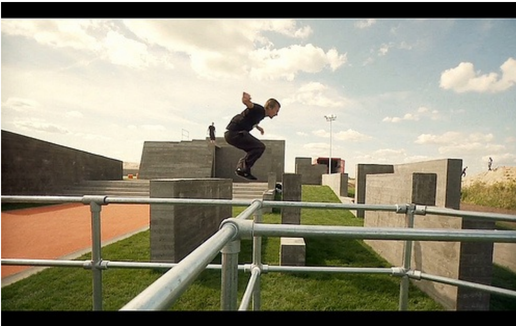
Still from Kaspar Astrup Schröder's My Playground , 2011.

Children navigating city streets in the same way probably wouldn't raise an eyebrow, but parkour's practitioners are out-of-short-pants urbanites who interact with their city in a comparably child-like, playful, creative way. Inventive, exploratory use of space is certainly one of the things we give up when adulthood strikes, but Danish artist, designer and film director Kaspar Astrup Schröder's My Playground makes a powerful argument for the value of play in enlivening city space and rousing its denizens from the dull slumber that defines their interaction with the places they live. It also shows a European sensibility far ahead of an American one in terms of integrating human beings and their urban environments. During several scenes in the documentary, members of Team Jiyo are shown collaborating with architects at the renowned Copenhagen architectural firm B.I.G. (Bjarke Ingels Group) Architecture , whose stacked apartment complex and parking deck Mountain Dwellings , have become popular places for parkour to re-imagine city space. Even while B.I.G. founding architect Bjarke Ingels picks Team Jiyo's brains about design, he seems activated and inspired by parkour's goals of creating a city that adapts to human interaction.